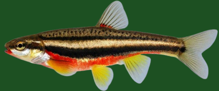
Southern Redbelly Dace (Intolerant)