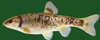
Central Stoneroller (Intermediate)