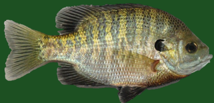
Bluegill Sunfish (Tolerant)