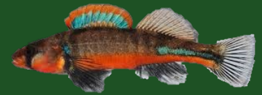
Sunburst Darter (Intolerant)