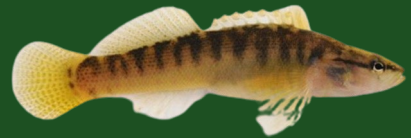
Fantail Darter (Intolerant)